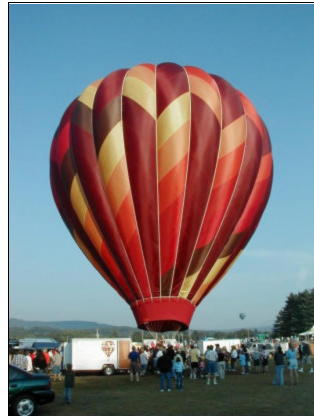
Photo from Annual Wellsville Balloon Rally

steps, the unification of stakeholders, amassing the resources and moving forward. Initial guidance for such movement is implicit to the comprehensive planning process. Economic security, development of infrastructure, business, and industry must unfold and flourish in concert with the preservation of our natural environment, cultural heritage and serve to improve our quality of life.